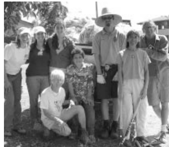
Friends of the UH Point