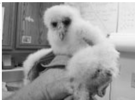
Baby barn owl

The Emergency Wildlife Hotline (619-225-9202 or 619-225-WILD) offers a phone bank of volunteers who field calls from the public about orphaned and injured wildlife and advice on "problem" wildlife issues. When trained volunteers are available, they may also rescue and/or transport injured or sick wildlife to the Care Center. If you find sick, injured or orphaned wildlife, please call (619) 225-9202 or (619) 225-WILD. A volunteer will determine if the animal needs assistance, then either direct you to the Care Center or an animal care volunteer near you. Make a difference! Lend our wildlife a helping hand! For more information about Project Wildlife, visit: www.ProjectWildlife.org .