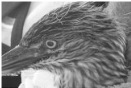
Juvenile black capped night heron

The group also offers an Education Department made up of volunteers from throughout San Diego County. Project Wildlife believes that public outreach goes hand-in-hand with wildlife rehabilitation. San Diego County has spectacular native wildlife. The group hopes to change attitudes and misconceptions by instilling awareness