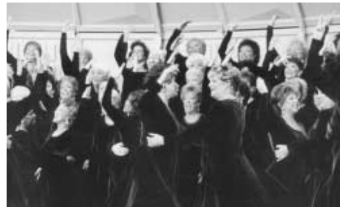
The San Diego Chorus

welcomes guests to visit us during our rehearsals. We rehearse on Wednesday nights from 6:30 pm to 9:30 pm. Our rehearsals are held at the Casa Del Prado, Room 207, in beautiful Balboa Park located in downtown San Diego. We look forward to seeing you!