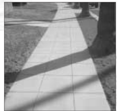
Pictured: Panorama Drive sidewalk – before & after